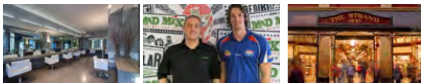
Charlie by SJB Interiors Mad Mex Melbourne Launch Strand Arcade eDM